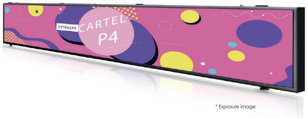
* Exposure image

Remote control through the Cosmi server. Wifi, 3G / 4G, brightness sensor and optional temperature sensor.